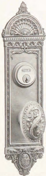
Nos. LC90 and LC68

When ordering give list number (in the case of escutcheons also lock number) and finish. For finishes see page 91.