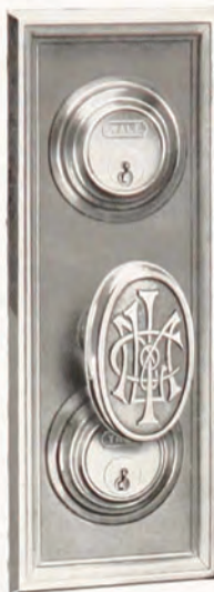
Lock No. 6000. Set No. JV7000 (page 262) Regularly furnished without monogram