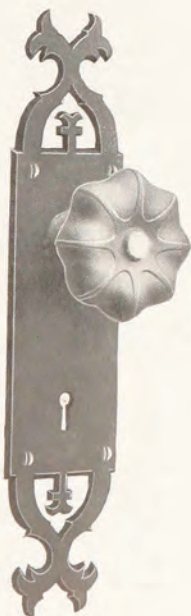
Nos. SA9 and SA897

When ordering give list number (in the case of escutcheons also lock number), size and finish. For finishes see page 91.