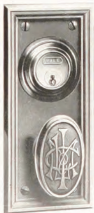
Lock No. 6010. Set No. JV7010 (page 262) Regularly furnished without monogram