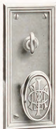
Lock No. 6020. Set No. JV7020 (page 262) Regularly furnished without monogram