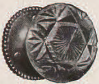
No. 422RB No. 422RP, same with Plain Rose