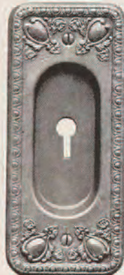
Nos. 432 1/4 and 1432 1/4