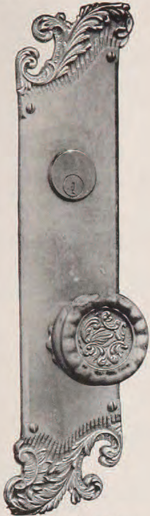
No. 1392 x 2846