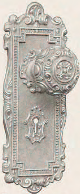
No. 1231 x 2822