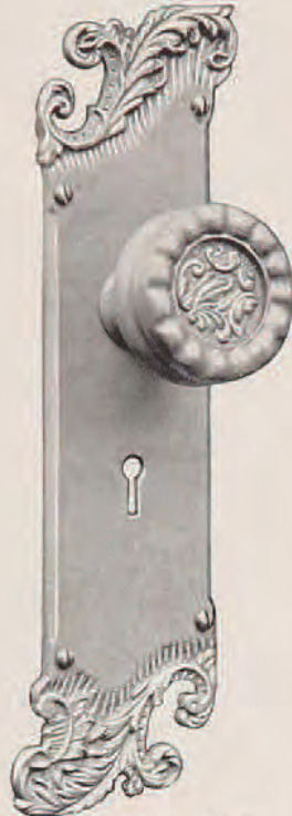
No. 1231 x 2822