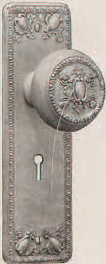
No. 131 1/4 x 822 1/4 No. 1131 1/4 x 2622 1/4