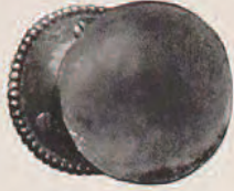
No. 122RB No. 122RP, same with Plain Rose