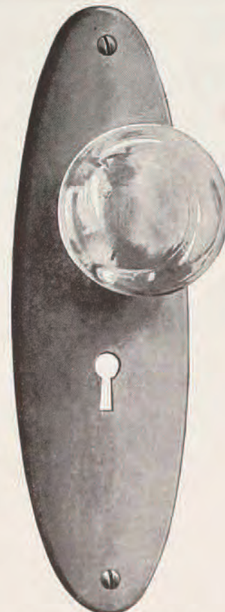
No. 122R x 1231/4 Putnam