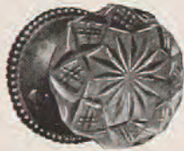
No. 622RB No. 622RP, same with Plain Rose