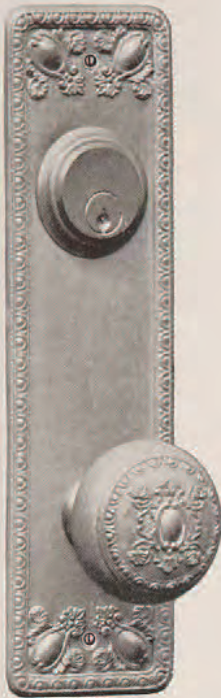
No. 1392 1/4 x 2646 1/4