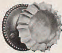
No. 522RB No. 522RP, same with Plain Rose