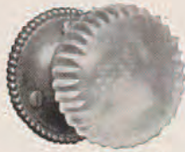
No. 322RB No. 322RP, same with Plain Rose