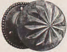
No. 222RB No. 222RP, same with Plain Rose