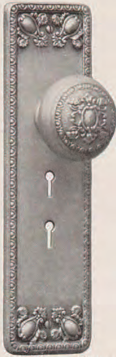
No. 01253 1/4 x 2624 1/4 No. 0253 1/4 x 824 1/4