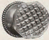
No. 722RB No. 722RP, same with Plain Rose