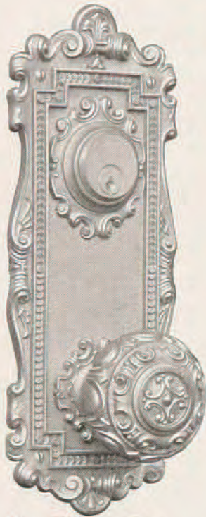
No. 1392 x 2846