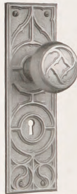
Nos. RC87 and RC35