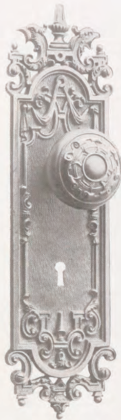
Nos. SG90 and SG35