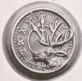
FIG. 9 ELKS 2 1/2 in. only