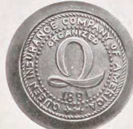
FIG. 15 INSURANCE 2 1/4 and 2 1/2 in.