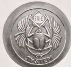
FIG. 14 RAILROAD 2 1/4 in. only