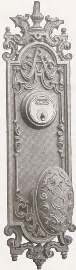
Nos. SG90 and SG68

See descriptive list of finishes, page 40.