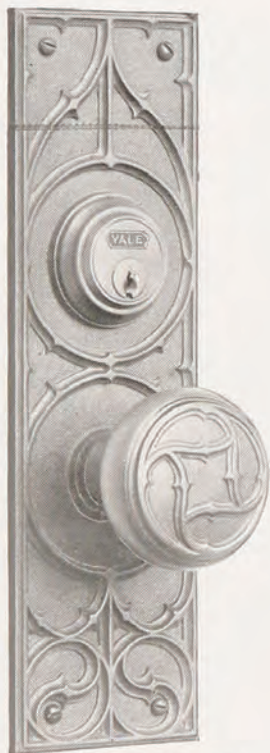
Nos. RC90 and RC36

See descriptive list of finishes, page 40.