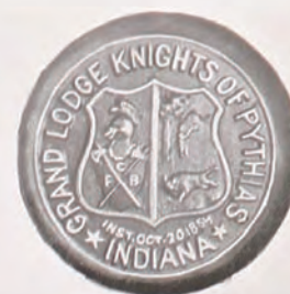
FIG. 4 K.of P. 2 1/2 in. only