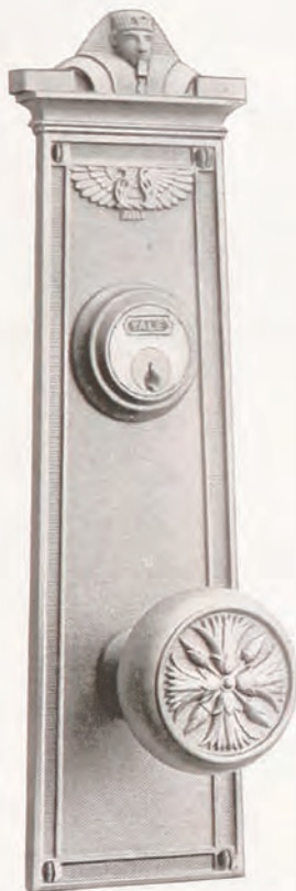
Nos. RK90 and RK35

See descriptive list of finishes, page 40.