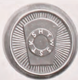
FIG. 1 MASONIC 2 1/4 in. only