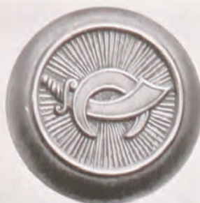
FIG. 2 MASONIC 2 1/2 in. only