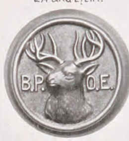
FIG. 11 ELKS 2 1/4 and 2 1/2 in.