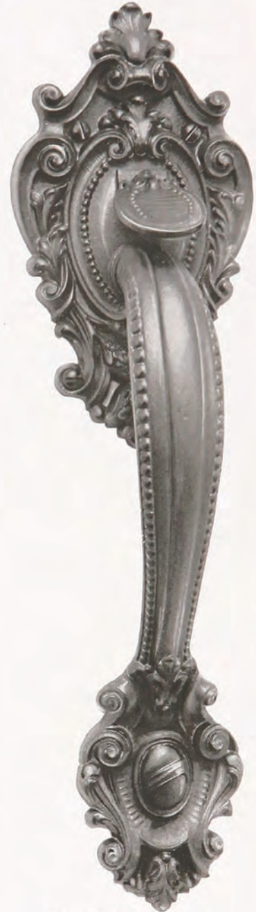
No. CP4534 Pavian Colonial school