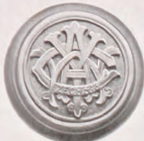
FIG. 5 Y.W.C.A. 2 1/2 in. only