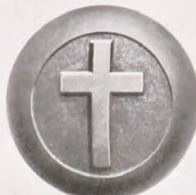
FIG. 7 CHURCH 2 1/4 and 2 1/2 in.