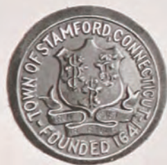
FIG. 13 MUNICIPAL 2 1/4 in. only