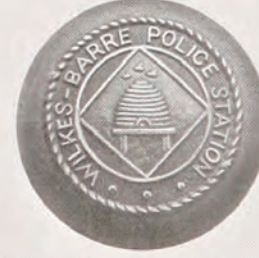
FIG. 20 POLICE 2 1/4 in. only