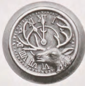
FIG. 10 ELKS 2 1/2 in. only