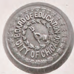
FIG. 17 SCHOOL 2 1/4 in. only