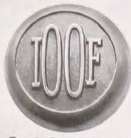
FIG. 6 ODD FELLOWS 2 1/4 and 2 1/2 in.