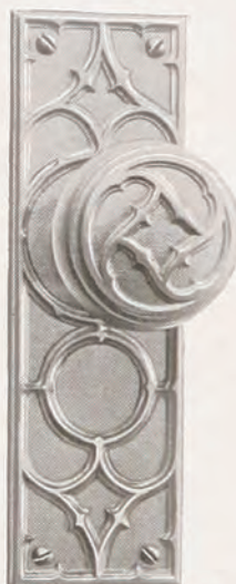
Nos. RC85 and RC35