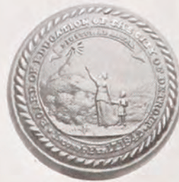
FIG. 19 SCHOOL 2 1/4 in. only