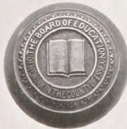
FIG. 18 SCHOOL 2 1/4 in. only